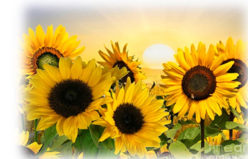
Illustration of sunflowers.